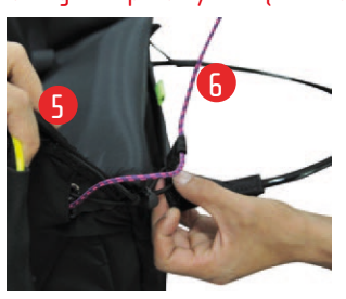
Installing the speed system (continued)