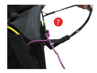
Installing the optional quick release footstrap