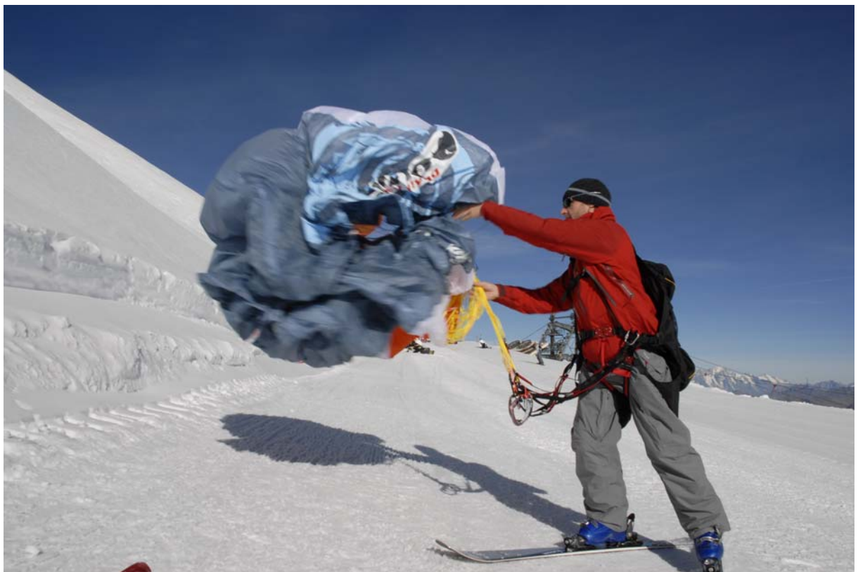
Enjoy your GIN Speedflyer Harness, Happy riding!!