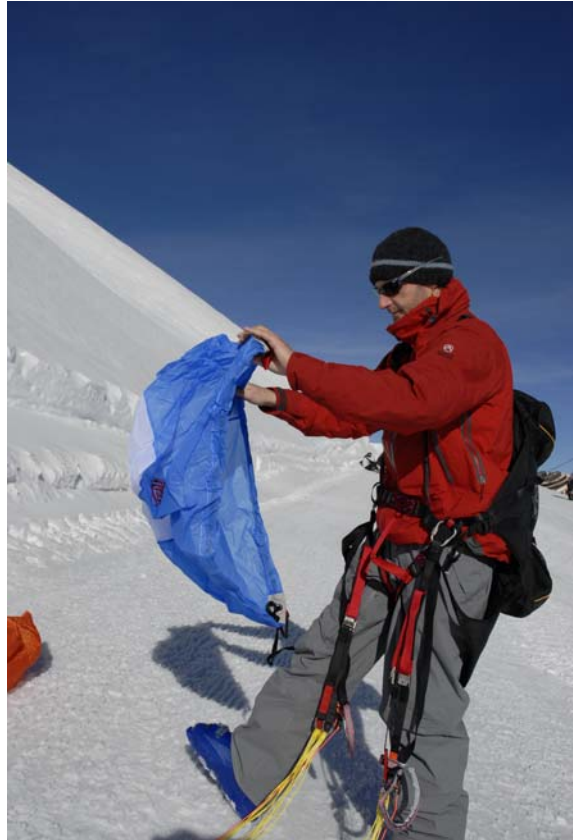
While wearing the harness for Speedflying, there is a "Quick Pack Bag" in a zipped pocket on the right leg. Use it to carry your bundled Nano while skiing to lifts between runs...