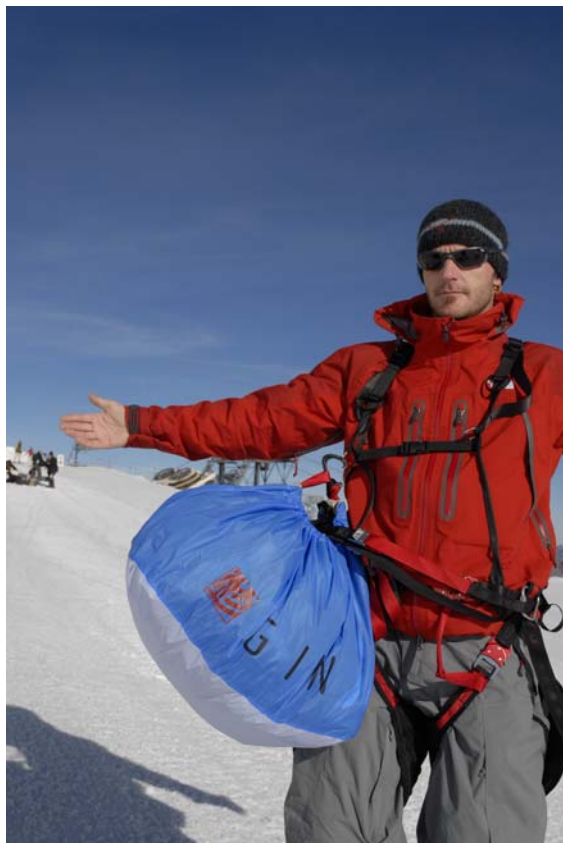
Easy, out of the way and stress-free!