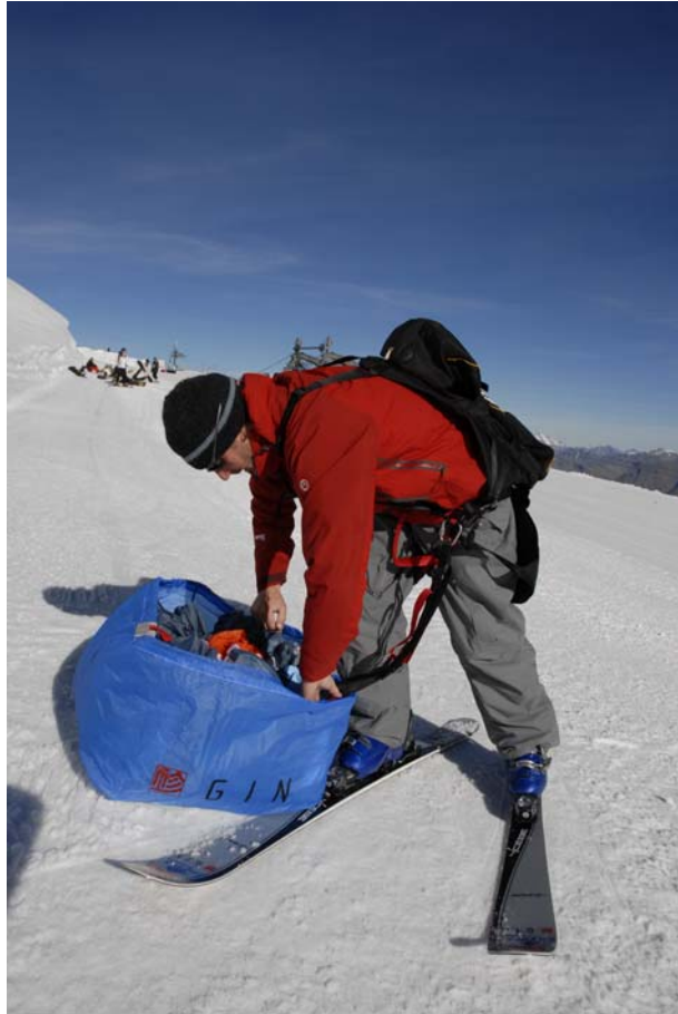
Back up to take off, take the canopy out and return the Quick Pack Bag to its pocket.