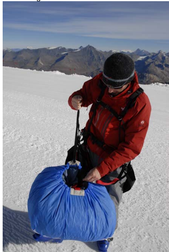
Bundle the canopy into the bag. Close the bag, pulling the black strap.