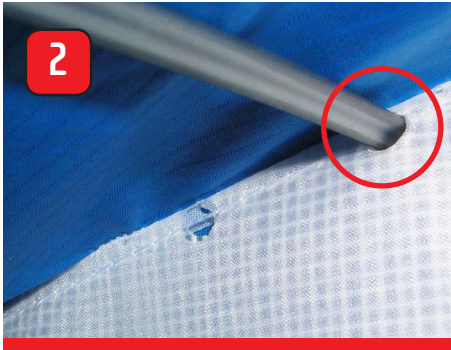
Push the wire through all the front holes on the ribs inside the glider near the top surface.