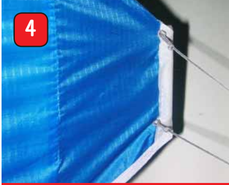
Place the plastic bar back in its sleeve with the wire seated in the groove of the plastic bar.