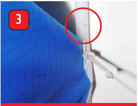
Fix the wire in one side of the plastic bar in the small groove in the bar as shown.