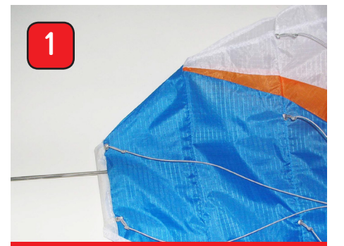
Remove the plastic bar and feed the wire through the tip hole.