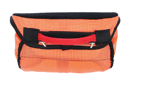
*Rescue bridle required