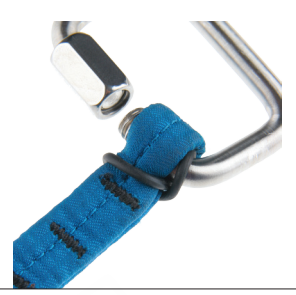
Attach the Y-bridle to the maillon and secure it with a rubber band